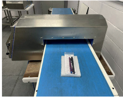
(Length 150mm Width 50mm Height 20mm)

Product passes through the centre of the aperture: